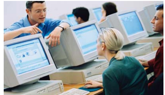
"ROI AT THEIR FINGERTIPS"

These offices are scheduled to install MedCorr 1.6 in 2005. In 1999, MedCorr became the accepted ROI application for Kaiser Permanente's business services offices at 22 sites in Southern California and is currently in use today.